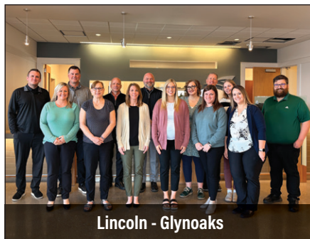
Lincoln - Glynoaks