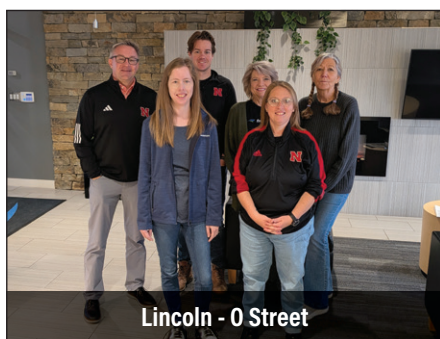
Lincoln - O Street